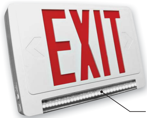
Patented Innovative Lightpipe Design