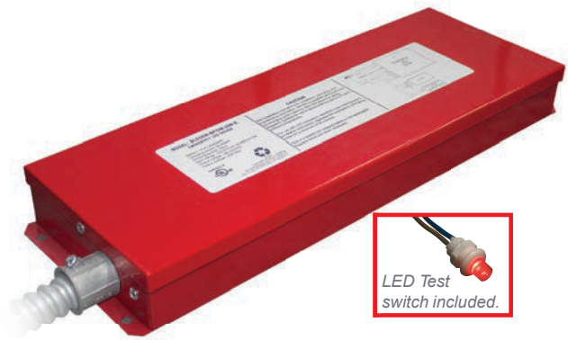
LED Test switch included.